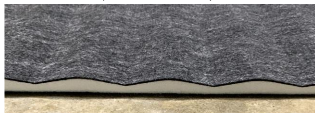
Side view of panel tested including sound-incident embossed surface.